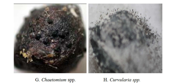
Figure 1. Growth of different types of seed borne fungal pathogens (A-H) on Tossa jute seed under stereo- microscope (X 250).