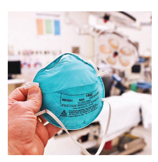
"...providers should renew their familiarity with airborne isolation procedures, which are seldom necessary in routine anesthesia practice."

Novel coronavirus outbreaks may be particularly hazardous to healthcare workers. An early report of 138 hospitalized patients with COVID-19 pneumonia from Wuhan,