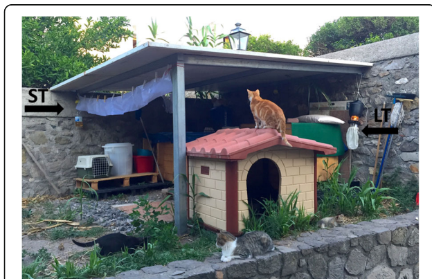
Fig. 2 Sand fly trapping in the premises of a household in the island of Lipari. In each of the eight sites, one light trap (arrow LT) and sticky traps (arrow ST) were monthly set and left working for two consecutive days

A total of 204 cats (104 in G1 and 100 in G2), belonging to 80 owners, were enrolled in the study on SD 0. The study population was composed of 111 females (54.4%) and 93 males (45.6%) with age ranging from 6 months to 15 years. During the study 45 cats (25 from G1 and 20 from G2) were removed or lost to follow up for different reasons (e.g. animal lost, collar lost and not replaced within two days, adverse events or suspected adverse drug reaction), whereas 159 animals (79 from G1 and 80 from G2) completed the study (Table 1). Amongst the excluded cats, 18 (8 from G1 and 10 from G2) were removed after the enrolment because found infected by L. infantum on samples collected on SD 0. On samples collected at the study closure (SD 360), 5 out of 79 cats in G1, and 20 out of 80 in G2 scored positive to L. infantum infection in at least one of the diagnostic tests (Table 2). The majority of animals tested positive by IFAT (15/25; 60%), whereas few cats were