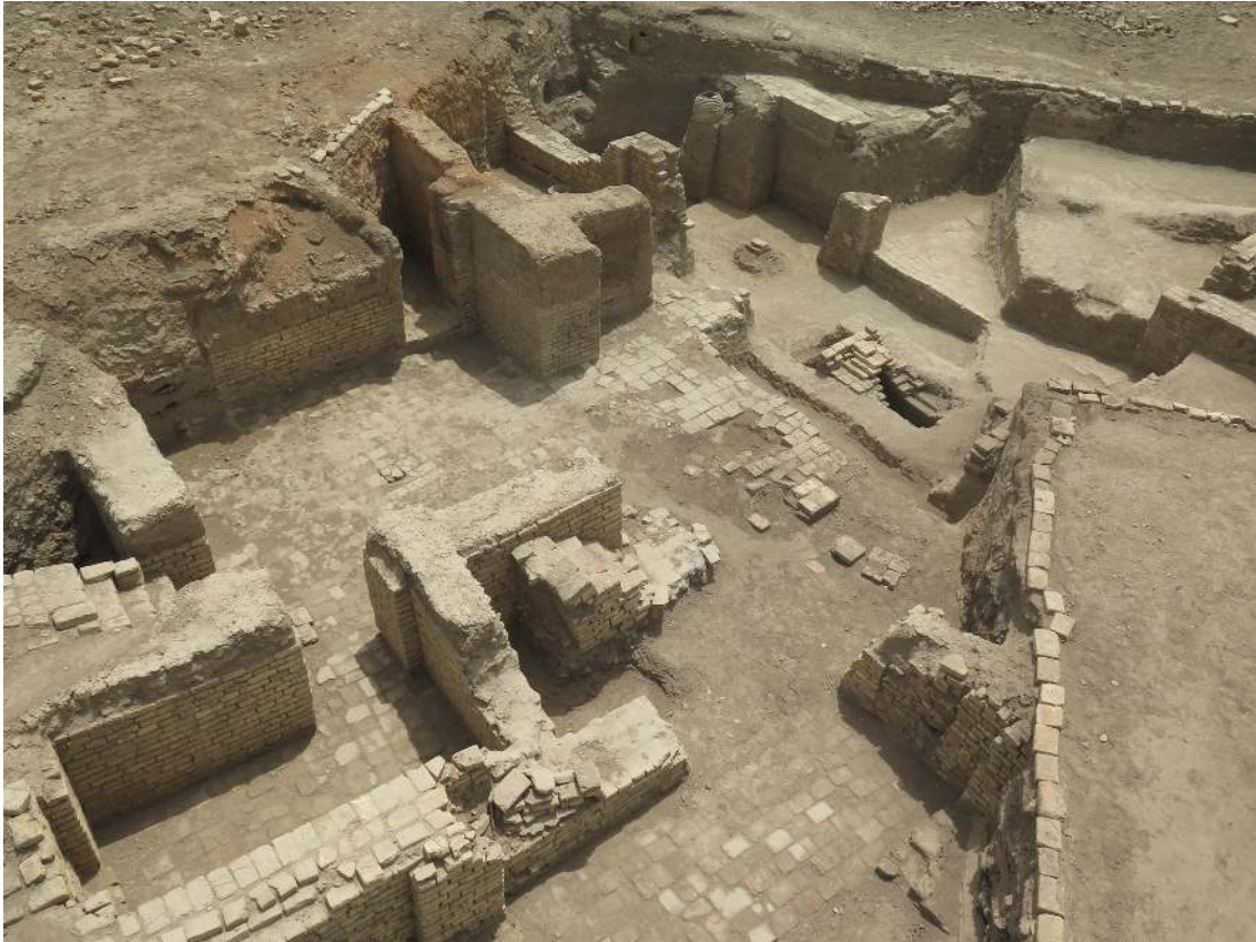
Figure 3. General view of General Abisum's house, in Area 3.