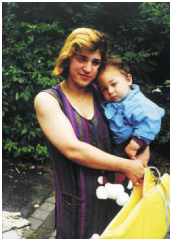
Figure 7. Refugees from the Balkans in Germany 1999.

Since 1978, the concepts of primary health care have proven repeatedly to be excellent guidelines for all programs of humanitarian assistance, in addition to being valuable in other fields. The concept of standardized Emergency Response Units of the IFRC is, therefore, a good example of the translation of the Alma-Ata ideas into action for the purpose of practical work in the field. Successful health and medical work in humanitarian disasters depends on a truly multidis-