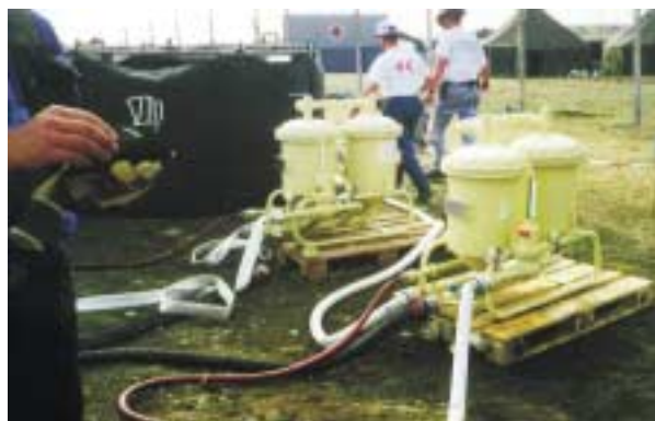
Figure 5. Water purification by an Emergency Response Unit of the International Federation of Red Cross and Red Crescent Societies, Macedonia 1999.

In comparison with the Great Lakes crisis in Africa, the classical epidemics in camps were not observed, perhaps because of the large scale humanitarian assistance and climatic conditions (49). Hospital morbidity and mortality records revealed the underlying morbidity of the regional population and, unlike in Rwanda, some form of underlying medical care of the displaced population existed before the migration. Within the camps in Macedonia, the referral hospital not only served as an emergency unit, but also, or even more, as the replacement for the lost regional inpatient facility for the expelled (Fig. 5).