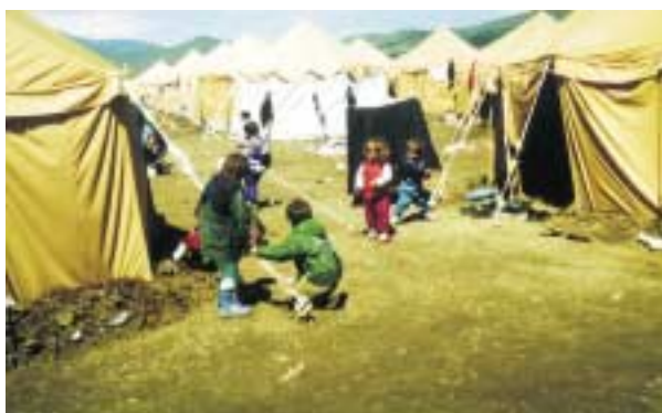
Figure 4. Stenkovec refugee camp, Macedonia 1999.

After the beginning of the forced mass migration of Albanian Kosovars into Albania and Macedonia (43-45), the Emergency Response Unit referral hospital of the IFRC was called into service in Macedonia and began to provide health care in the Stenkovec 1 camp on April 12, 1999. On the Macedonian territory, several camps neighboring the border of the Federal Republic of Yugoslavia received some ten thousand people expelled from Kosovo who had spent days or weeks on the road or in the no-man's land infernal, cold, and muddy makeshift-camp Blace, without shelter or sanitation. During the spring of 1999, Stenkovec 1 refugee camp, north of the Macedonian capital Skopje, housed between 9,000 and 35,000 displaced persons from Kosovo (Fig. 4).