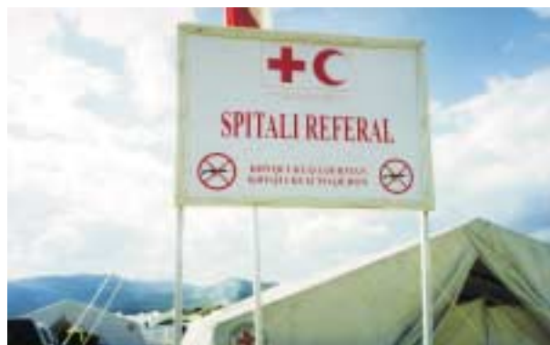
Figure 6. Referral hospital of the International Federation of Red Cross and Red Crescent Societies, Macedonia 1999.

Historically, there had been many symptoms of growing tension and hatred in the region long before the military actions in Kosovo. Again, as in Central Africa, the international community did not take any effective steps on time to prevent the conflict. Therapeutic intervention in the form of humanitarian assistance during and after fighting surely was an effective, but a delayed reaction (Fig. 6).