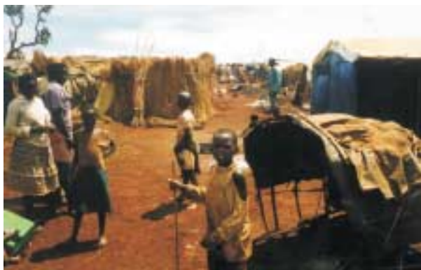
Figure 2. Benaco refugee camp, Tanzania 1995.

Zaire and Tanzania induced an unprecedented worldwide humanitarian campaign for the displaced Hutu population near the Rwandan borders (22-31). In the overcrowded camps in Zaire, resting on solid volcano rock near Goma, the water supply and sanitation problems finally caused a cholera outbreak that killed about 50,000 people within a few weeks (21). Humanitarian action and assistance focused on the very basic needs according to the primary health care concept. During the so-called Great Lakes Crisis, from 1994 until 1996, the Emergency Response Unit referral hospital of the IFRC was in full operation in the field for the first time. On the Tanzanian side in the Benaco camp near Ngara, the referral hospital was the major medical referral unit for a population of at least half a million (Fig. 2).