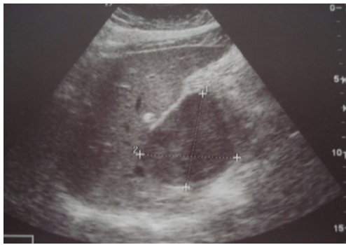
Fig. 1 Abdominal ultrasound image showing a hypo-echoic mass developed in segment I of the liver, with regular outlines

lines. Thus, according to the absence of other foci of lymphoma, a diagnosis of diffuse large B cell primary hepatic lymphoma was established. The patient was referred to oncology for chemotherapy. She received 8 cycles of CHOP protocol (cyclophosphamide–doxorubicin–vincristine–prednisolone). The postoperative course is simple. The patient is currently in 2-years follow-up with a good evaluation.