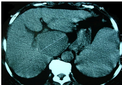
Fig. 2 Abdominal CT scan without contrast showing a hypo-dense mass with regular contours, measuring 10×7 cm at the expense of the caudate lobe of the liver

The etiology of this disease is still unknown. However, the presence of chronic inflammation of the liver parenchyma (hepatitis B or C), an EBV infection, or immunosuppression (human immunodeficiency virus HIV) seems to play an important role in the pathogenesis of PHL [4–6]. Hepatitis C is found in 40–60 % of patients with PHL [1], suggesting that there is a strong association between HCV and non-Hodgkin