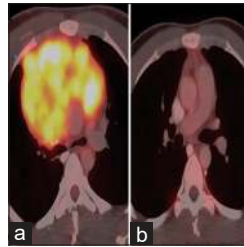
Figure 2: Comparative positron emission tomography-computed tomography scan images in axial section of the patient showing prechemotherapy disease extent (a) and complete metabolic response after completing chemotherapy (b)

of primary gonadal tumor to the extragonadal location, where the primary disease has subsided and hence remains undetected. PMGCTs constitute approximately 10%–15% of all mediastinal tumors, whereas PMMGCTs constitute only 1%–4% of the mediastinal tumors. [4] Liu et al. reported that mediastinal seminomas accounted for approximately 33% of all PMMGCTs followed by immature teratoma (25.9%), yolk-sac tumor (20.4%), and mixed tumors (9%). [5] There is a paucity of data of PMMGCT in Indian patients in the form of case reports and short case series. [6,7] In our series, seminomas constitute 3/5 of all malignant GCTs, whereas the nonseminomatous group comprises yolk-sac tumor (1/5) and mixed tumor (1/5).