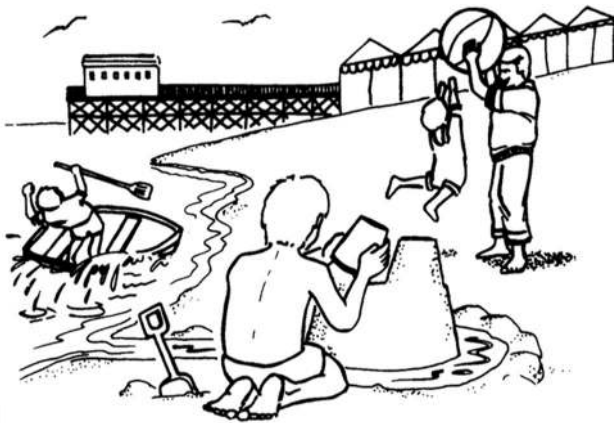
Fig. 2 Example of a picture that can be used to elicit conversational speech (reproduced with permission of Professor EK Warrington). A scene of this kind can be used to assess naming and also to probe aspects of language comprehension, at the level of single words (using questions such as, ‘Where is the sandcastle?’) and grammatical relations embodied in sentences (using instructions such as, ‘Point to the thing that the boy is holding above the boat’)

forward and major neuroanatomical associations are in bold italics: a, amygdala; ATL, anterior temporal lobe; BG, basal ganglia; h, hippocampus; IFG, inferior frontal gyrus/frontal operculum; ins, insula; OFC, orbitofrontal cortex; PMC, posterior medial cortex (posterior cingulate, precuneus); STG, superior temporal gyrus; TPJ, temporo-parietal junction. The ‘target diagrams’ below show typical profiles of neuropsychological test performance for each syndrome; concentric circles indicate the percentile scores relative to a healthy age-matched population and the distance along the radial dimension represents the level of functioning in the following cognitive domains: ex, executive skills; l, literacy skills; n, naming; nm, nonverbal memory; pr, phrase repetition; s, sentence processing; v, visuo-spatial; vm, verbal memory; wr, word repetition