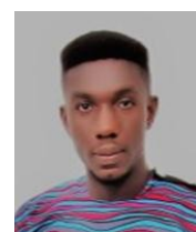
(+ Corresponding author)