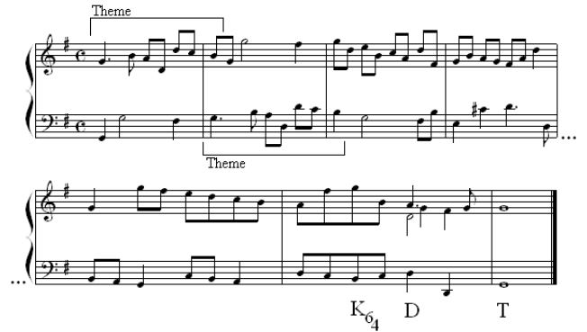
Figure 5. G. F. Handel – Fugue G dur, b. 1 – 4 and 17 – 19