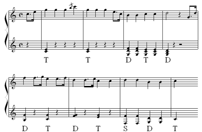
Figure 6. J. Haydn – Sonata C-dur, Part I, bars 1 – 8

But as the main features of the new multi-voice style – the presence of a chord accompaniment for the melody with a strictly expressed functional dependency – are defined within the frames of the polyphonic type of multi-voice texture, so in the works of the Viennese classic composers – founders of the homophonic type of multi-voice texture, individual polyphonic methods can be found with the purpose of enriching the expression: