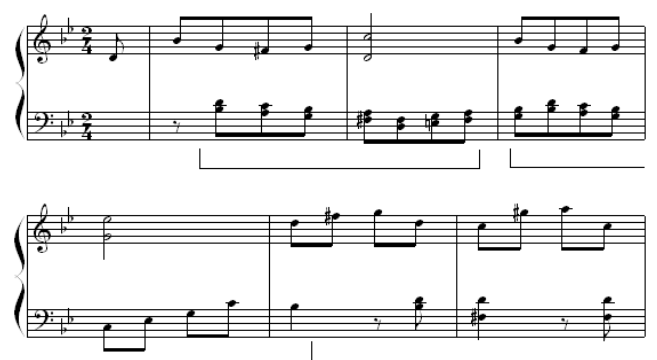
Figure 7. L. W. Beethoven – Sonata № 19, Part I, b. 1 – 6

But as the main features of the new multi-voice style – the presence of a chord accompaniment for the melody with a strictly expressed functional dependency – are defined within the frames of the polyphonic type of multi-voice texture, so in the works of the Viennese classic composers – founders of the homophonic type of multi-voice texture, individual polyphonic methods can be found with the purpose of enriching the expression: