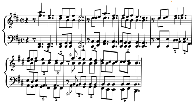
Figure 9. Cl. Debussy – “Moonlight”, adaptation for a choir, b. 8 - 15

In the Expressionism style, we can see again the leading role of the phonism in the horizontal and in the vertical plain. In the works of the Expressionist authors, sharp interval combinations have been purposefully sought (here the interval is viewed in the light of a building element of the melody, as well as of the harmony). Portrayed through these sharp interval combinations were mainly strong, painful feelings of fear, terror, despair.