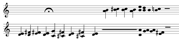
Figure 10. Iv. Spasov – “Forest charm” for a choir

Phonism and functionality as properties of the sound complex are found in a synergy or a struggle for dominance in the different styles: phonism dominated over functionality during the Baroque era, had an aligned position during the Romanticism and was established as the main form construction principle during the Impressionism, Expressionism, Dodecaphony; functionality was the main driving force for musical development in the Classicism, was in an equal position with phonism during the Romantic era, lost its position in the Impressionist era and was completely deconstructed in the dodecaphony.