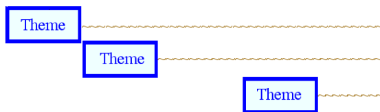
Figure 3. Polyphony, linear thinking

And so, within the frame of the polyphonic type of multi-voice texture, a new type of musical thinking – the homophonic, i.e. the vertical, slowly appeared and was established. The reasoning behind it being defined as such is based in the fact that the melody – the main bearer of musical content – is clarified functionally (the changes in its stability-instability are clarified) and it is accompanied, varied, enriched through the chords. The chord in the homophonic type of multi-voice texture is a ready construct – there are 4 types of triads, seven types of tetrads; they all have methods for application, defined by clear rules.