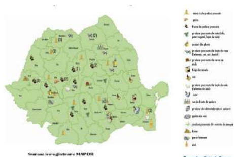
Fig.4. Repartition of the organic foodstuffs (MAPDR)[16]