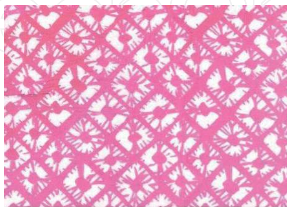
Figure 1. Sappanwood on cotton fabric.

Dried samples were then analyzed further for color parameters and fastness according to the specified standards. Figures 1 and 2 shows printed cotton and silk using indigo, Figures 3 and 4 printed cotton and silk using madder, and Figures 5 and 6 printed cotton and silk using sappanwood.