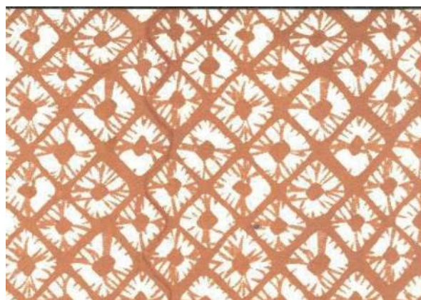
Figure 3. Madder on cotton fabric.