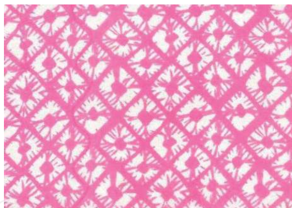
Figure 2. Sappanwood on silk fabric.