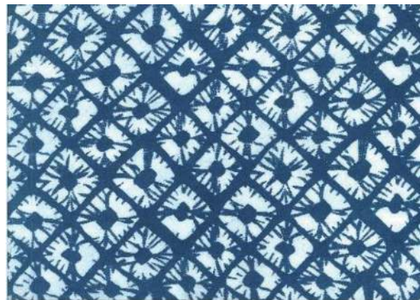
Figure 5. Indigo on cotton fabric.