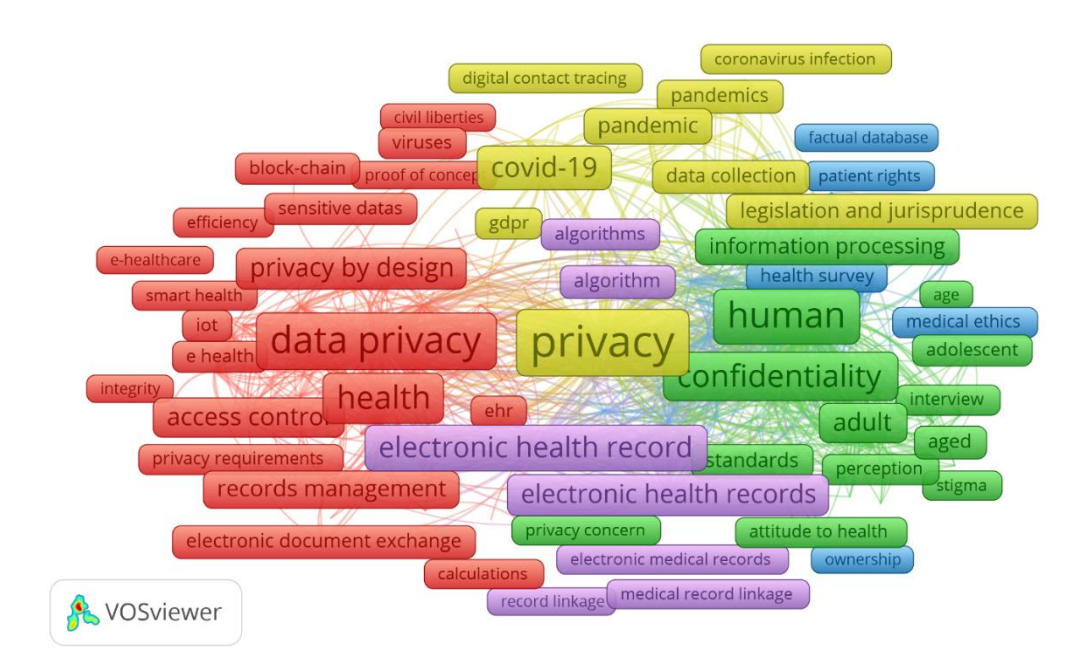
Figure 2. Keyword maps analysis

The VOSviewer software [43], a tool for creating and visualizing bibliometric networks, created a network between the author keywords and the publications that used them. Figure 2 shows a network visualization of the authors' keywords. The relationships between the keywords are illustrated using colour, square size, text size, and the thickness of connecting lines. Keywords that share the same hue, for instance, appeared to be grouped. Therefore, in this research, privacy, COVID-19, pandemic, digital contact tracing, pandemics, and coronavirus infection have the same colour (yellow), indicating a close association between the terms and their frequent cooccurrence together. Considering the frequency of occurrences (after data cleaning on the author keywords), the keywords such as privacy and human were the most used in the privacy and COVID-19 study. The top 20 keywords used in the privacy and COVID-19 research are shown in Table 5.