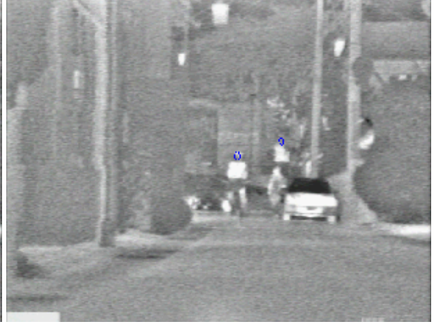
Figure 3': Output Frame 2