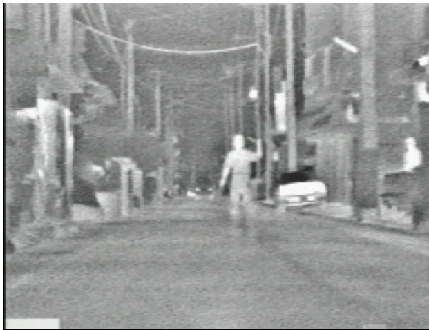
Figure 2: Input Frame 1

The implementation is quite robust to noise and occlusions. In Figure 2', the pedestrian on the right is significantly occluded and is still detected by the system.