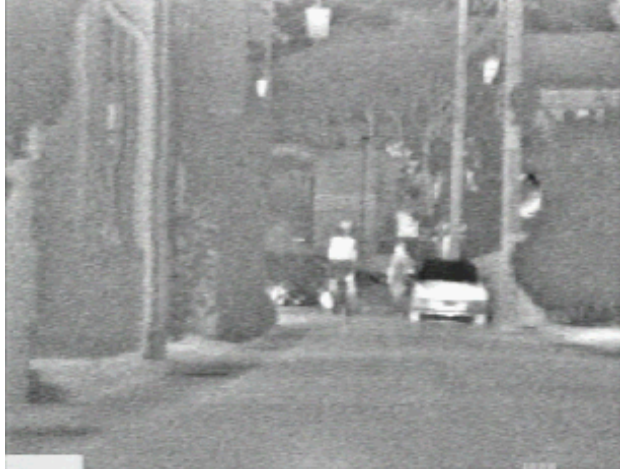
Figure 3: Input Frame 2