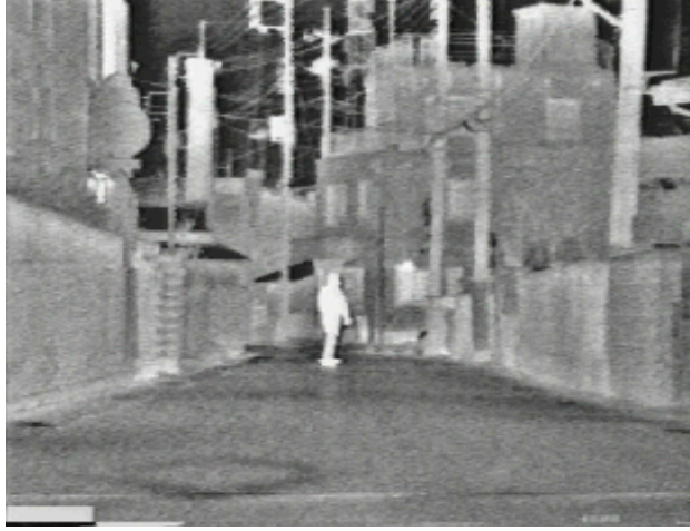
Figure 4: Input Frame 3