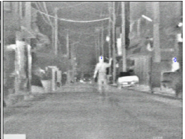
Figure 2': Output Frame 1