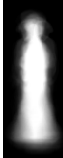
Figure 1: Probabilistic Template