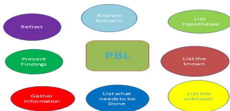
Figure 1. The process of learning (PBL)

In traditional approaches to learning based on traditional way, data is provided first in traditional way of learning, but in PBL problems are presented to the students' to solve the problem. Figure 1 represents the process of learning and showing how each step is inter-connected to each other.