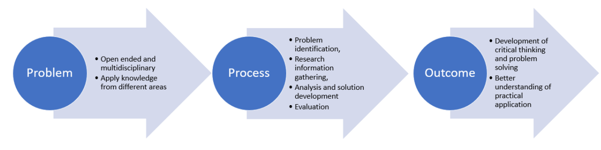
Figure 3 The main component for problem-based learning.

communication skills, as well as a better understanding of the practical applications of theoretical knowledge [12, 15]. Students are also able to demonstrate their ability to apply their knowledge to real-world problems and develop innovative solutions (Fig. 3).