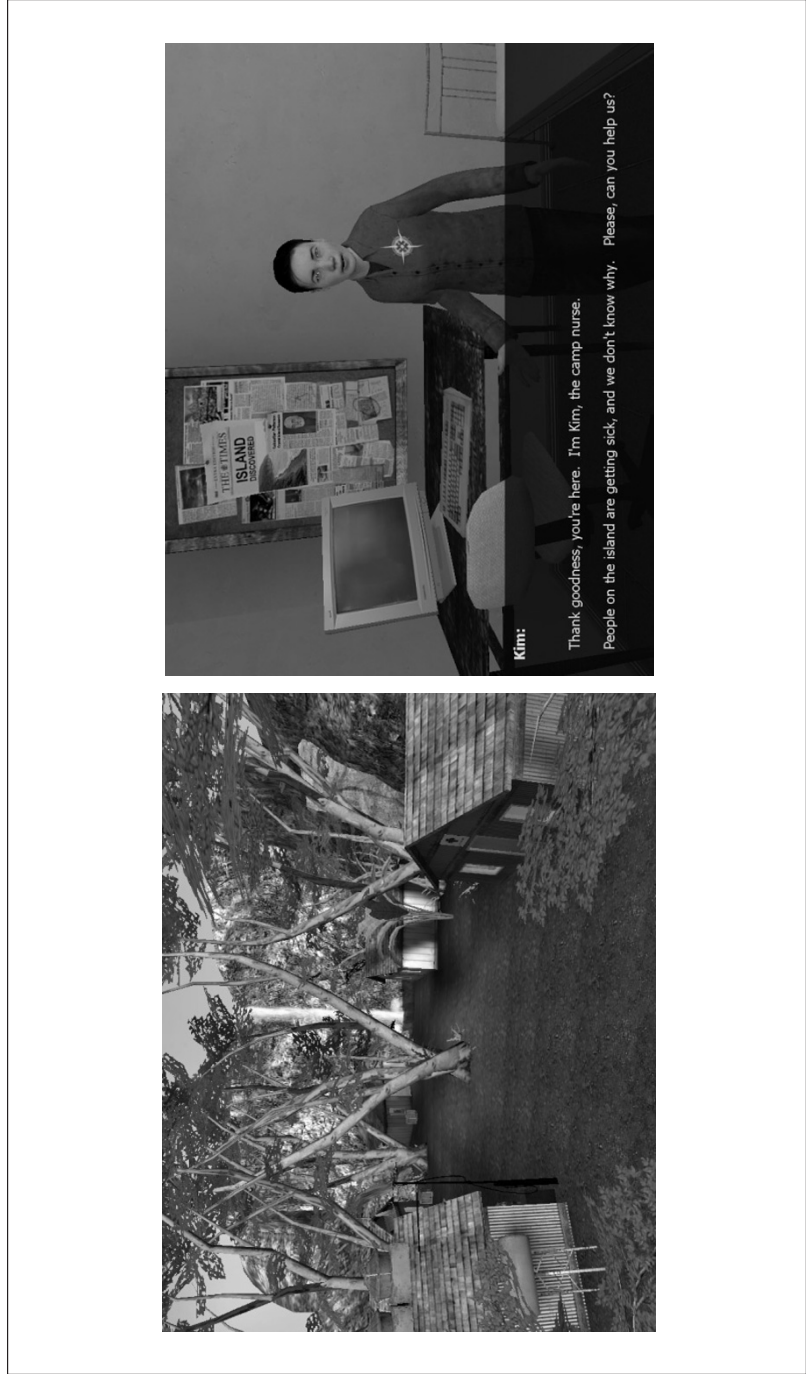
Figure 1. CRYSTAL ISLAND learning environment.