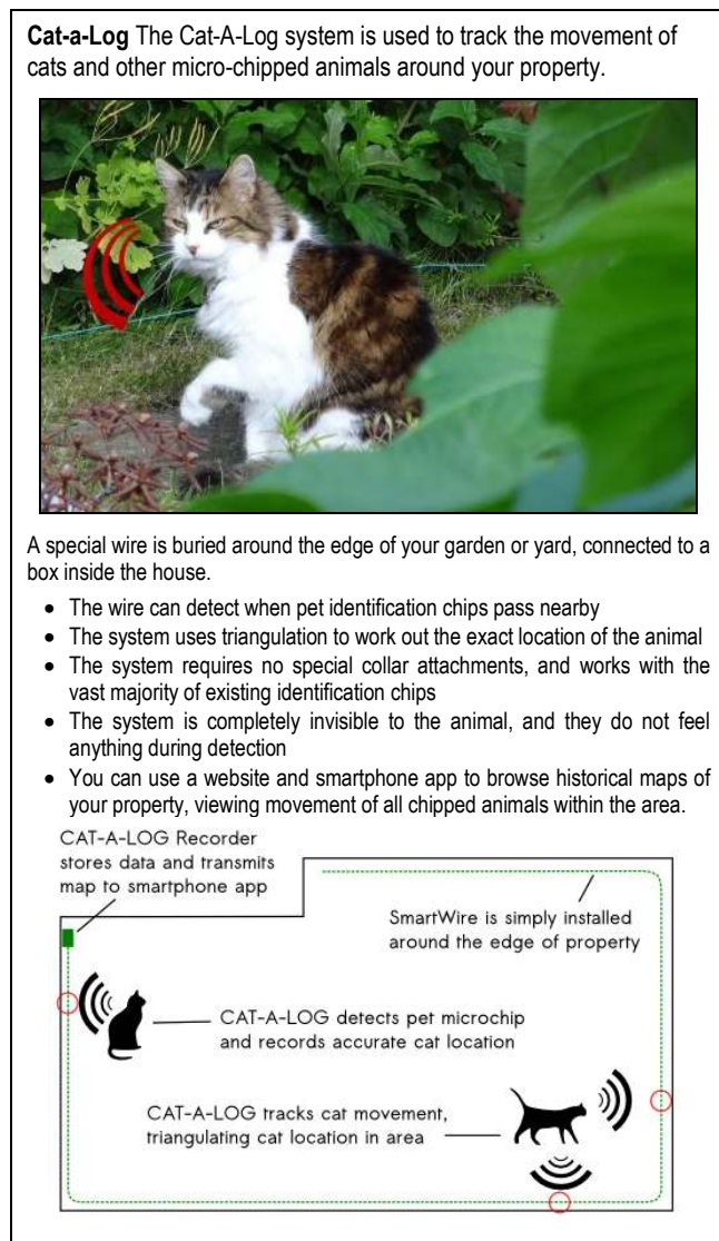
Figure 2 – Example narrative, rhetoric and imagery generated for the Cat-a-Log product.

optimistic (i.e. techno-utopianist) language expresses the supposed benefits of the technologies, but the actual functionality of the systems are obscured (through the use of “clever algorithms”). The prototypes themselves were built using exposed circuitry and wiring to signify their upstream or “near-future” prototype status, as well as lend plausibility to the promised functionality. Although the products were said to be based on “extensive scientific research” there is no evidence for such statements, echoing standard rhetoric drawn from the start-up aesthetic. This attention to the framing of the prototypes was deemed important in order to convey a coherent narrative of near-future technology. Our three prototypes were: Cat-a-Log, EmotiDog and LitterBug; the (speculative) functionality of each is discussed in detail in the following sub-sections.