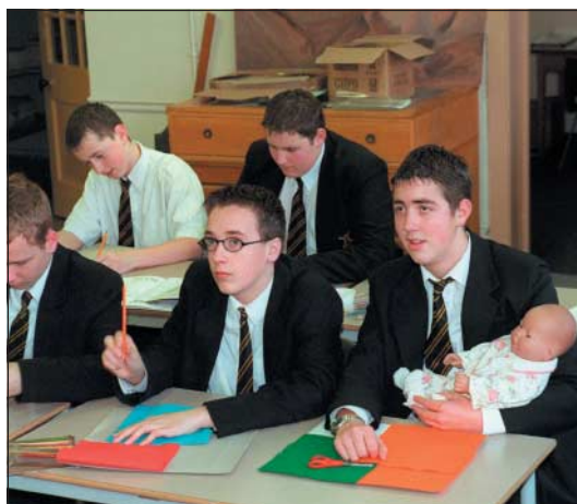
Baby talk: the most effective sex education?

Although “process” and “qualitative” are often used interchangeably, data for process evaluation can be both quantitative and qualitative. For example, in a series of systematic reviews of research on health promotion and young people, 33 (62%) of 53 process evaluations collected only quantitative data, 11 (21%)