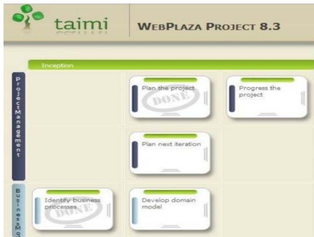
Figure 3. A project with two completed tasks