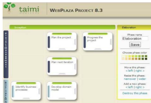
Figure 1. Adding a new phase into a process model

In Taimi, a task in a process model can be seen as a best practice with supporting templates or other guidance. The tasks can be completed with as specific or general descriptions as needed for the common benefit of the organization. The users of a process model can comment on their experiences related to the model as well as suggest improvements to the model immediately when an issue arises during a project.