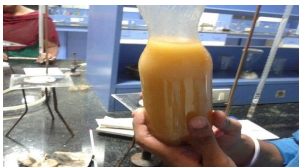
Figure 5. Mixture after reaction.

Transesterification: Initially the Algae oil was heated to 60 °C in a flask. In another flask 7.5 ml of H 2 SO 4 was added in 50 ml of ethanol. Then Algae oil was added to ethanol solution. Stirring was done for 15 min and then allowed it to settle. After 24 hours the settled ethyl esters was separated and send them to Transesterification reaction for recycling [61-72] (Figure 5).