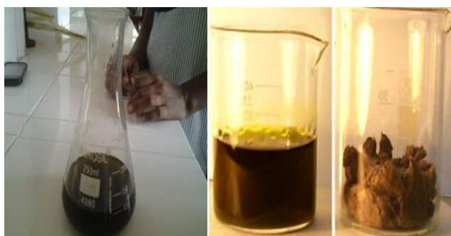
Figure 4. Algae Oil extracted from samples.

Algae Oil Extraction: We used ethyl alcohol as solvent for our experiment. Here using Ethyl alcohol as solvent we extracted Algal Oil. Then algal oil heated in Water Bath at 70 °C (BP of Ethyl alcohol) to evaporate the remaining Ethyl alcohol in Oil. Finally we extracted 100 ml of Algae Oil [51-60] (Figure 4).