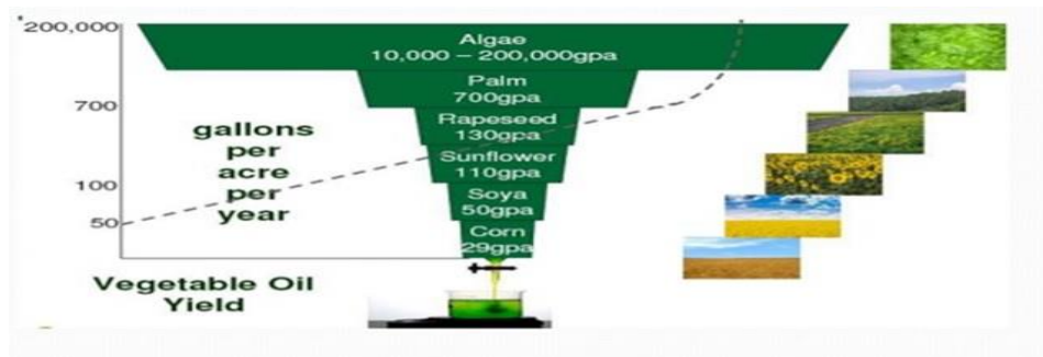
Figure 1. Comparative study of biodiesel with different feed stock [20].

Algae produce 7 to 31 time greater oil than palm oil. It is very simple to extract oil from algae. The best algae for biodiesel would be microalgae (Figure 1). Eg. Spirogyra plant.