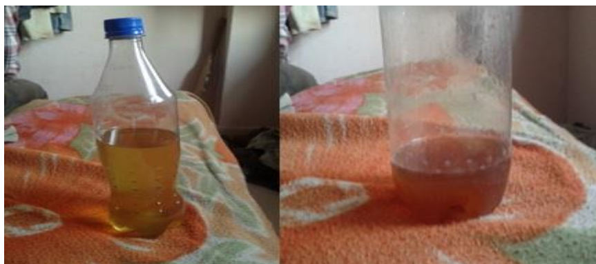
Figure 6. Separated biodiesel and glycerol from mixture.

By doing this test it has proven that there is no residual methanol present in biodiesel.