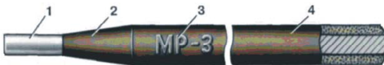
Fig. 1: The structure of MP-3 welding electrode 1 – pin; 2 – transition area; 3 – electrode mark; 4 – coating.

Therefore, the production of modern high-quality electrodes requires improvement of technologies for electrodes production, used materials and corporate culture. The production of welding electrodes is an appropriate treatment of each material, comprising the coating, prescribed dosage, production of homogeneous