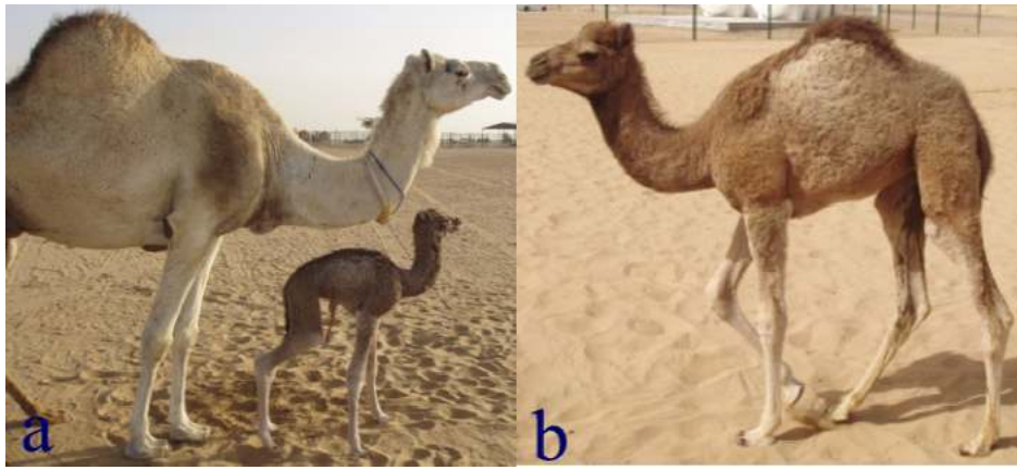
FIG. 3. The first cloned camelid, a female dromedary camel calf named Injaz: on the day of birth (a); and 2 mo old (b), growing well (photograph taken on 8 June 2009).

of the above-mentioned methods, assuming that the metaphase spindle was visible during the nucleation process. In our observations, dromedary camel oocytes are dark because of their high lipid content, like porcine and buffalo oocytes, making it impossible to see the metaphase spindle under an inverted microscope without an aid. The removal of oocyte chromatin prior to NT is of crucial importance in order to 1) avoid aneuploidy, with its detrimental effects on later development; 2) eliminate any genetic contribution of the recipient cytoplasm; and 3) exclude the possibility of parthenogenetic activation and embryo development without the participation of the newly introduced nucleus.