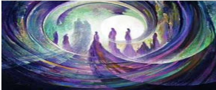
Figure 2. Connectedness.

complement one another's achievements. Gradually, change led to an intrinsic sense of connectedness through shared leadership, dialogue, and participants' study of new pedagogical skills.