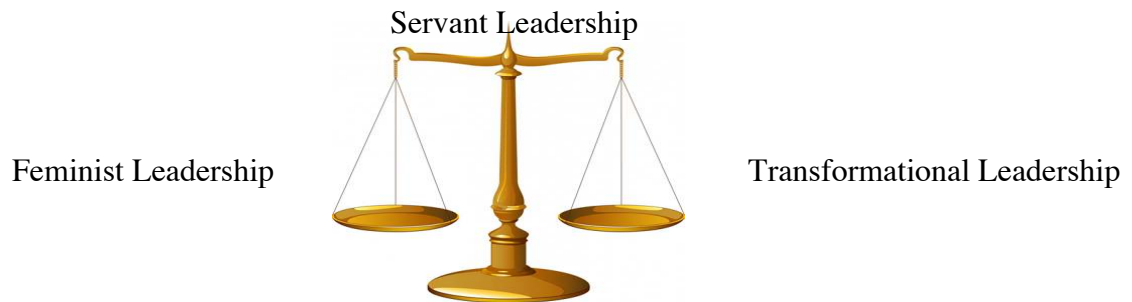
Figure 3. Leadership Platform.

met with more success when I found an apartment for our family in need. Hence, as servant leadership built an individual's sense of worth, aspects of feminist leadership gained balance through my penchant to care.