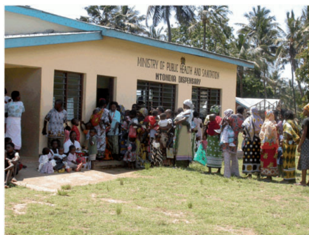
Figure 5 Mothers with their children queue for immunization services in a health facility within the KHDSS area during the World Pneumonia Day celebrations (12 November 2011)

Individuals are matched to the population register on five criteria: names, sex, date of birth, place of residence and household characteristics (including the names, sex and ages of co-residents). As children are not formally named for several weeks after birth, it is more efficient to search on the mother's identity and use internal links in the database to navigate to the relevant child. A bespoke database query programme was designed to create and filter potential matches and link the unique personal identity to clinical episodes. The programme can also match patients on a variety of different identity numbers that have been pre-populated in the population register, including NIDC number, Mother and Child Booklet number, hospital admission