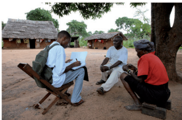
Figure 4 A census interview underway in a homestead within the KHDSS area