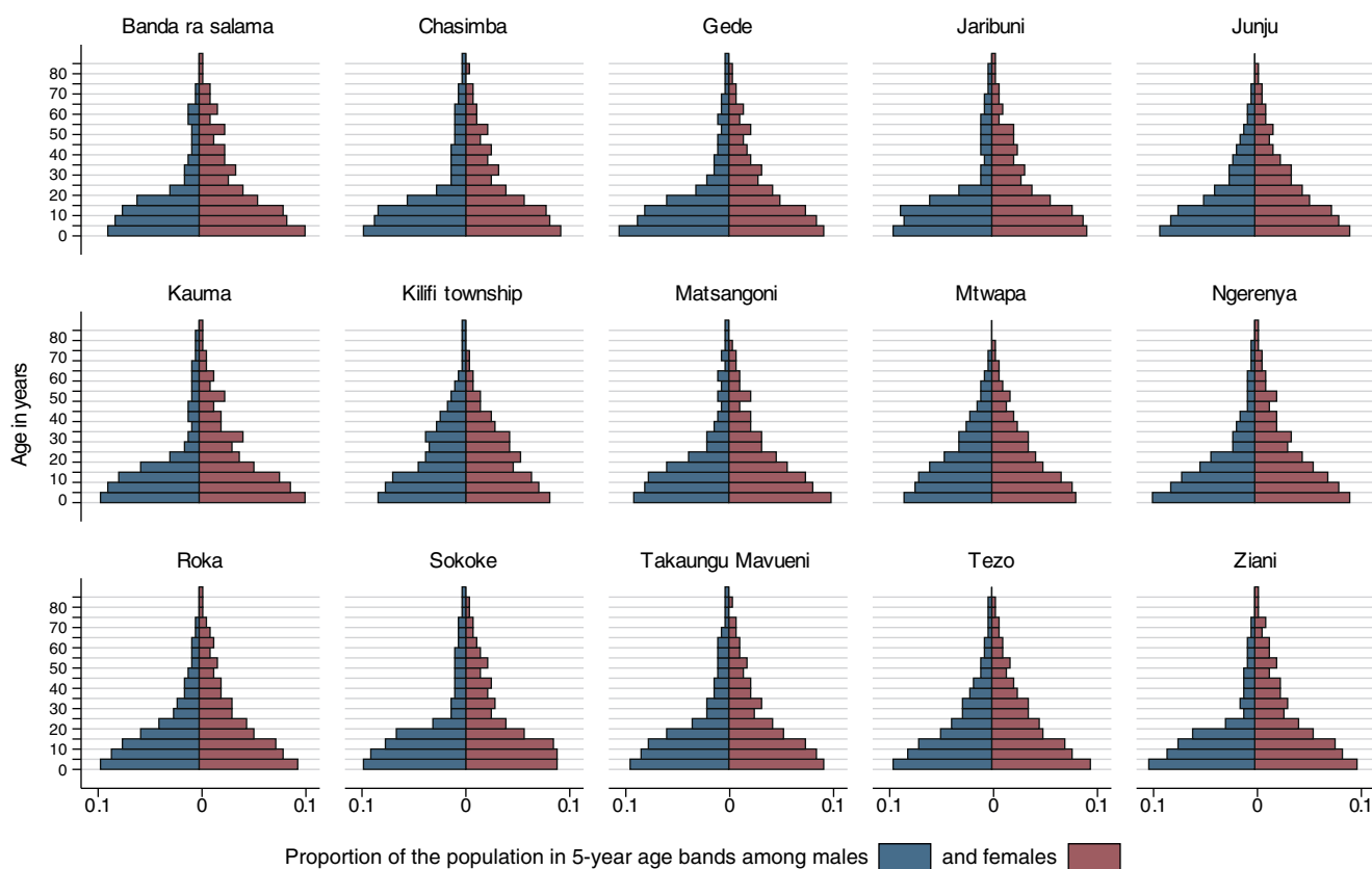
Figure 3 Population pyramids of the 15 administrative locations within the KHDSS. Data are taken from the 23rd enumeration round (date of median observation: 18 March 2011). Predominantly rural environments (the majority) show a marked attenuation of adult residents especially evident among males. Urban (Kilifi Township) and peri-urban areas (Mtwapa, Tezo) show a more gradual attenuation of the population with age, and a more even sex ratio