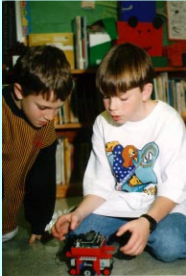
Figure 2 Fourth-grade students test the behaviors of their Programmable Brick “creature”

ties—so that it could connect to the interests and experiences of a wide variety of people. While some people might use the Brick to create their own scientific instruments, others might use it to create their own musical instruments.