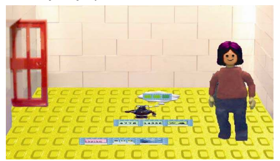
Figure 1 The ToonTalk programming environment. The programmer's avatar is on the right, and a robot generating a sequence of numbers in the centre

ToonTalk (Figure 1) is a language and a programming environment designed to be accessible by children of a wide range of ages, without compromising computational and expressive power. Following a video game metaphor, the programmer is represented by an avatar that acts in a virtual world. Through this avatar the programmer can operate on objects in this world, or can train a robot to do so. Training a robot is the ToonTalk equivalent of programming. The programmer leads the robot through a sequence of actions, and the robot will then repeat these actions whenever presented with the right conditions. ToonTalk programs are animated: the robot displays its actions as it executes them.