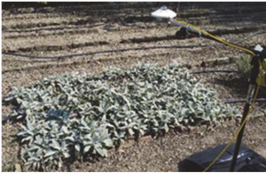
Figure 2. Measurement of canopy albedo on Stachys byzantina according to ASTM E1918-16 (2016) (Modena, September 2016)