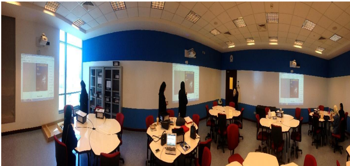
Figure 2. An ALPs Classroom

The third subsystem is a state of art classroom environment named Active Learning Programs (ALPs). Equipped with interchangeable tables, the ALPs provide a suitable setup for teamwork or individual activity and the kind of cooperative learning modes appropriate for engineering students. All-round writable walls allow students to perform presentations using a variety of media such as posters or whiteboards as well as work on documentation. As shown in Figure 3, each ALPs classroom is equipped with five interactive and high definition projectors which can be uniquely allocated to each team. This facilities activities such as screen-written annotations, teachers' notes and real-time review of documentation as well as cross-team sharing.