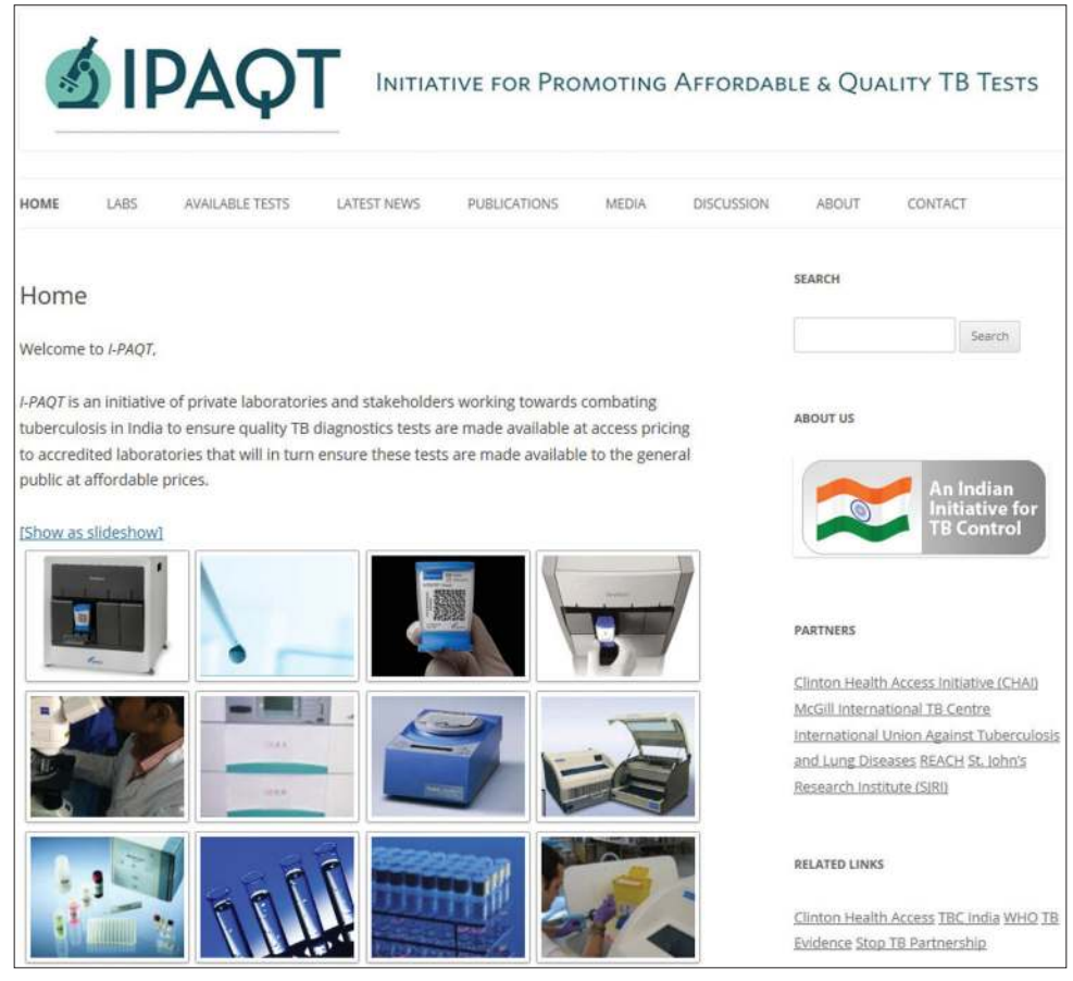
Figure 2: Web site of the initiative for promoting affordable, quality TB tests initiative (www.ipagt.org)

Since its launch in March of 2013, the IPAQT initiative has already achieved a pan-India presence-with 42 labs which encompasses over 3000 franchisee labs and greater than 10,000 collection centers committed to providing these tests at affordable prices [Figure 2]. The number of labs is expected to increase significantly in the