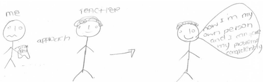
Figure 1 "At school there's a teacher I can talk to, she's my second parent"