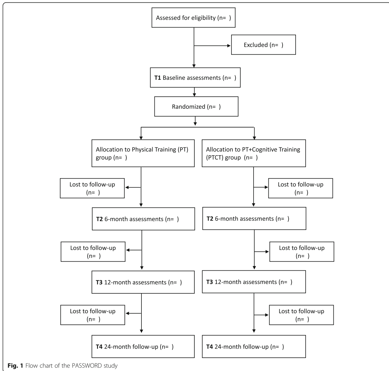
Fig. 1 Flow chart of the PASSWORD study

Secondary outcomes are 6-min walking distance, dual-task cost in walking speed, fall incidence and executive function. In the 6-min walking test, participants are encouraged to walk up and down a 20-m circuit for