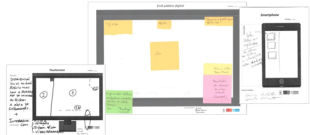
Figure 2. A paper prototype outcome from the workshops.

The final workshop, that materialized the work done on the others, had the following purposes: