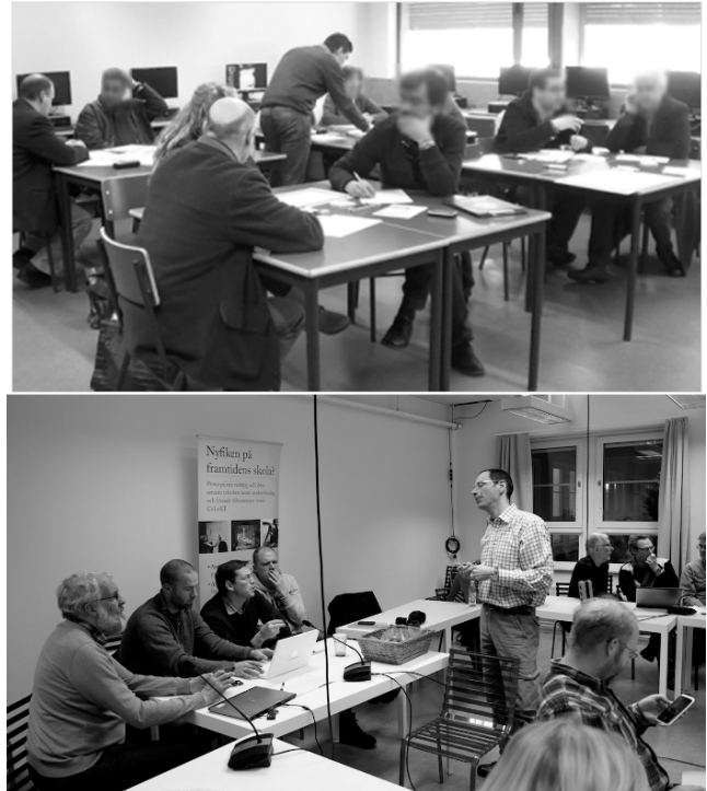
Figure 1. Photos from the workshops in Portugal (above) and Sweden (below).

loop that whatever may happen within the broader and more