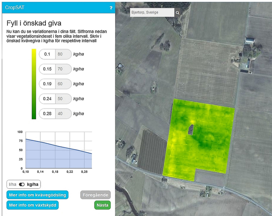
Fig. 1 Variation in vegetation index calculated by the AgriDSS CropSAT ( http://www.cropsat.se ) from a satellite image and visualized on a chosen field in Google Earth. Five levels of nitrogen application are set and can be used as a basis for calculations of a VRA

current challenges. A sustainable ICT system is, for example, characterized by longevity, simplicity, accessibility, responsiveness, and adaptability (Misund and Høiberg 2003). In particular, there is an increasing need for ICT studies with demonstrable impact on mitigating the threats to environmental sustainability (e.g., vom Brocke et al. 2013; Malhotra et al. 2013). The development and deployment of future sustainable agriculture requires acquisition, application and adaptation of knowledge, with the support of appropriate ICT systems (Dutta et al. 2014). Hence, the primary role of ICT systems within sustainable development is to create and communicate action possibilities for sense-making and sustainable practicing (Seidel et al. 2013).