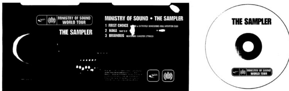
Figure 3 An example of the 3-track CD giveaway to consumers at venues as part of the 555 MOS program in 1997. 35 Dance music was an integral part of the 555/MOS Tour. Tour promotions were supplemented by these CD samplers as well as 'CD Sessions', three 1-h MOS CDs playing in HORECA outlets by local DJs to promote 555 and 'Radio Sessions', which were recorded radio DJ sessions for local stations. 35 BAT paid MOS to make this CD sampler as giveaway as well as Club Culture Guides (brochures) and branded jackets, T-shirts, baseball caps and record bags, all of which featured the 555/MOS key logo and intended as giveaways (see figure 4 for logo) 35