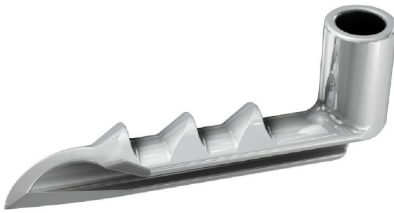
Figure 1 The iStent.

iStent comes preloaded in a customized single-use stainless steel inserter used to guide and release the stent directly into Schlemm's canal. The inserter features a release button activated by the surgeon to release the stent from the inserter.