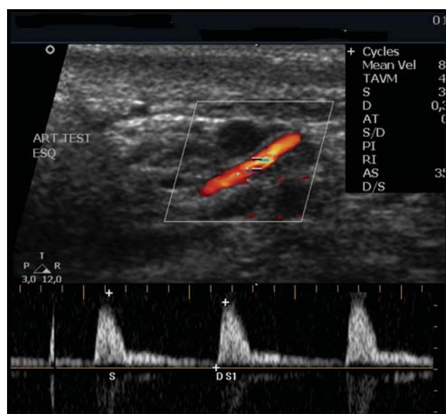
FIGURE 1 - Doppler ultrasonography showing the testicular artery in red

transducers. The testicular artery was identified in its distal portion, at a distance of 1 cm from the upper pole of the testicle, by using a transducer with angulation of less than 60° (Figures 1 and 2). The examinations were performed with the patient in supine position, at three times: before the operation and then selectively in the third and sixth months after the operation. The contralateral equivalent was the control. The variables studied were the testicular volume, systolic velocity (SV), diastolic velocity (DV), resistance index (RI) and pulsatility index (PI). The statistical method utilized was the model of analysis of variance between repeated measurements.