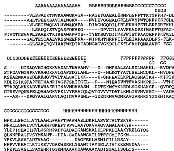
Figure 2: The alignment of seven representative globins from Bashford et al. [1]. Above the alignments are indicated which alpha helix each column belongs to. Bashford et al. identified 8 helices (A to H), but some regions are not well defined (especially CD, D, and FG). The sequences and their SWISS-PROT identifiers are from the top: Human \alpha (HBA$HUMAN), human \beta (HBB$HUMAN), sperm whale myoglobin (MYG$PHYCA), larval Chironomous thummi globin (GLB3$CHITP), sea lamprey globin (GLB5$PETMA), Lupinus luteus leghemoglobin (LGB2$LUPLU), and bloodworm globin (GLB1$GLYDI).

est of these seven. The alignment of the seven is shown in figure 2.