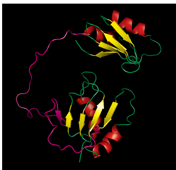
Figure 2. Structure of the human polypyrimidine tract-binding protein showing two domains with the disorder regions (magenta) predicted by DISOPRED.

Examining the NMR structure (Figure 2) indicates two domains with a very long linker region as predicted by DomPred. One domain does indeed have a four-stranded ferredoxin-like fold, but the other domain has a five-stranded sheet. Tentatively, DomSSEA seems to have made a mistake. Further investigation, using DISOPRED, reveals a disordered region between these domains, shown in magenta on Figure 2. Examination reveals that this disordered region runs through the fifth strand in the sheet. The chain before this strand also appears to be disordered. It seems likely that this \beta -strand is either an artifact of the NMR refinement or a transient feature of the native structure. This conclusion is further supported by