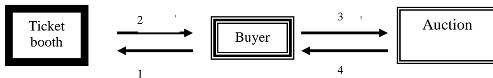
Figure 1 Authentication protocol

(2) Since only a single user and a single auction service share the session key, any message is encrypted and securely transmitted. It provides authentication at the beginning of the communication, then all further communication are assumed to come from the authenticated entity. It also provide authentication and encryption for each message sent from one entity to another. With an asymmetric key system, it also provides encrypted communication between users and auctions. Overall, it takes four steps for a buyer to place a bid in any single auction. Figure 1 illustrates the four steps.