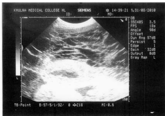
Fig-II: USG of abdomen showing appendicular growth with loculated immobile ascities.

thick gelatinous material. Study of this material showed sugar 3.5 mmol/L, Protein 5.1 gm/dl and no malignant cell was found. Ultrasonogram guided FNAC of the mass in the abdomen revealed mucin secreting malignant cells and the comment was mucinous adenocarcinoma (Fig-III)