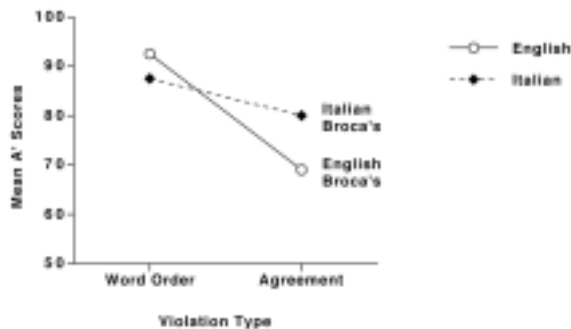
Figure 2: Grammaticality Judgment Scores for English vs. Italian-speaking Patients with "agrammatic" Broca's aphasia

lexical and grammatical errors, forcing a rethinking of aphasic syndromes in terms of processing deficits rather than loss of linguistic content. This conclusion is supported by studies of sentence comprehension, production and grammaticality judgment, all showing significant differences between patient groups that correspond directly to cross-linguistic differences in normals. Across studies of both comprehension and production, both Broca's and Wernicke's aphasics retain the basic word order biases of their native language (e.g. SVO in English, Italian, German; SOV in Turkish and Japanese; both SVO and SOV in Hungarian, depending on definiteness of the object). In the same studies, use of grammatical morphology proves to be especially vulnerable in receptive processing, but the degree of loss is directly correlated with strength of morphology in the premorbid language. In studies of grammaticality judgment, fluent and nonfluent patients show above-chance abilities (at equivalent levels) to detect subtle grammatical errors, often in constructions that they themselves can no longer produce without error (Devescovi et al. 1997 for Italian, Linebarger et al. 1983, Lu et al. in press for Chinese, Shankweiler et al. 1989 for Serbo-Croatian, Wulfeck 1988).