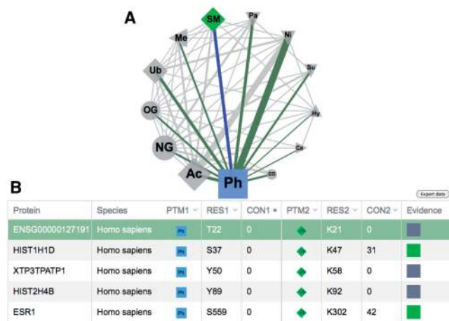
Figure 2. The PTMcode database uses in its first release 13 different types of PTMs that are abbreviated in a two letter code as: Ph (phosphorylation), NG (N-linked glycosylation), Ac (acetylation), OG (O-linked glycosylation), Ub (ubiquitination), Me (methylation), SM (SUMOylation), Hy (hydroxylation), Ca (carboxylation), Pa (palmitoylation), Su (sulfation), Ni (nitrosylation) and CG (C-linked glycosylation). The known and predicted functional associations between two of these types of modifications are accessible by selecting any two PTM types in an interactive network that offers all possible connections (A). These connections are constrained by the fact that both modifications at least should happen in the same protein. The PTM types are represented here by symbols, the size of which corresponds to their relative abundance in the database. The link widths represent the number of proteins modified by the two respective PTM types normalized by the total number of proteins harbouring the less abundant PTM type. The width thus indicates relative coverage of the particular pair-wise functional associations. For instance, based on the link widths, we see that a large proportion of proteins that are nitrosylated are also phosphorylated, while the proportion of proteins that are both hydroxylated and phosphorylated is smaller. Upon selection in the WEB interface, two types of modifications are activated, and all the pairs of known and predicted functional association in all proteins are shown in a table (B) where each of the entries can be further explored. These tables are available for download as text files.

PTMcode is accessible through the url http://ptmcode.embl.de . The web interface provides a browser to access all proteins that have some known or predicted functional associations between PTMs (Figure 2) and a search engine where the user can introduce a protein sequence or any protein id. In addition, the user can restrict the search to a particular residue or protein region. PTMcode is a protein-oriented database, as one of the major motivation for the resource is to help experts of particular proteins or research fields to explore functional hypotheses. A flash-based graphic interface enables intuitive interactivity. A single or many functional associations can be explored, and supporting information (alignment, structure etc) for each of the five channels can be easily called, all within the context of the protein domain architecture with links to the respective SMART entries. Figure 3 shows an overview of the predicted functional co-regulation by several post-translational modifications of a protein within the PTMcode environment.