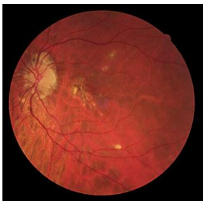
Fig. 3. Retinography of the LE performed 1 year later, revealing a chorioretinal scar.