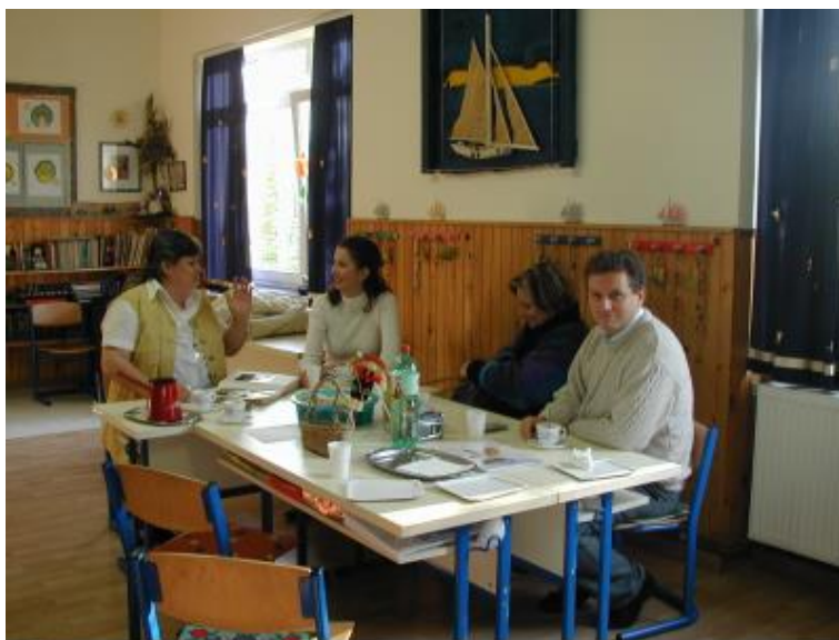
Figure 2. A meeting of teacher action researchers