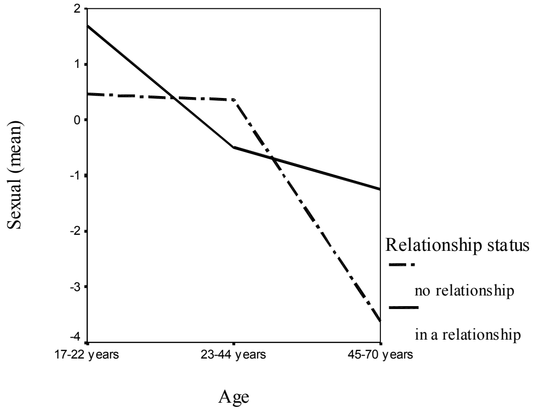
FIG. 2. Interaction for age by relationship status on sexual