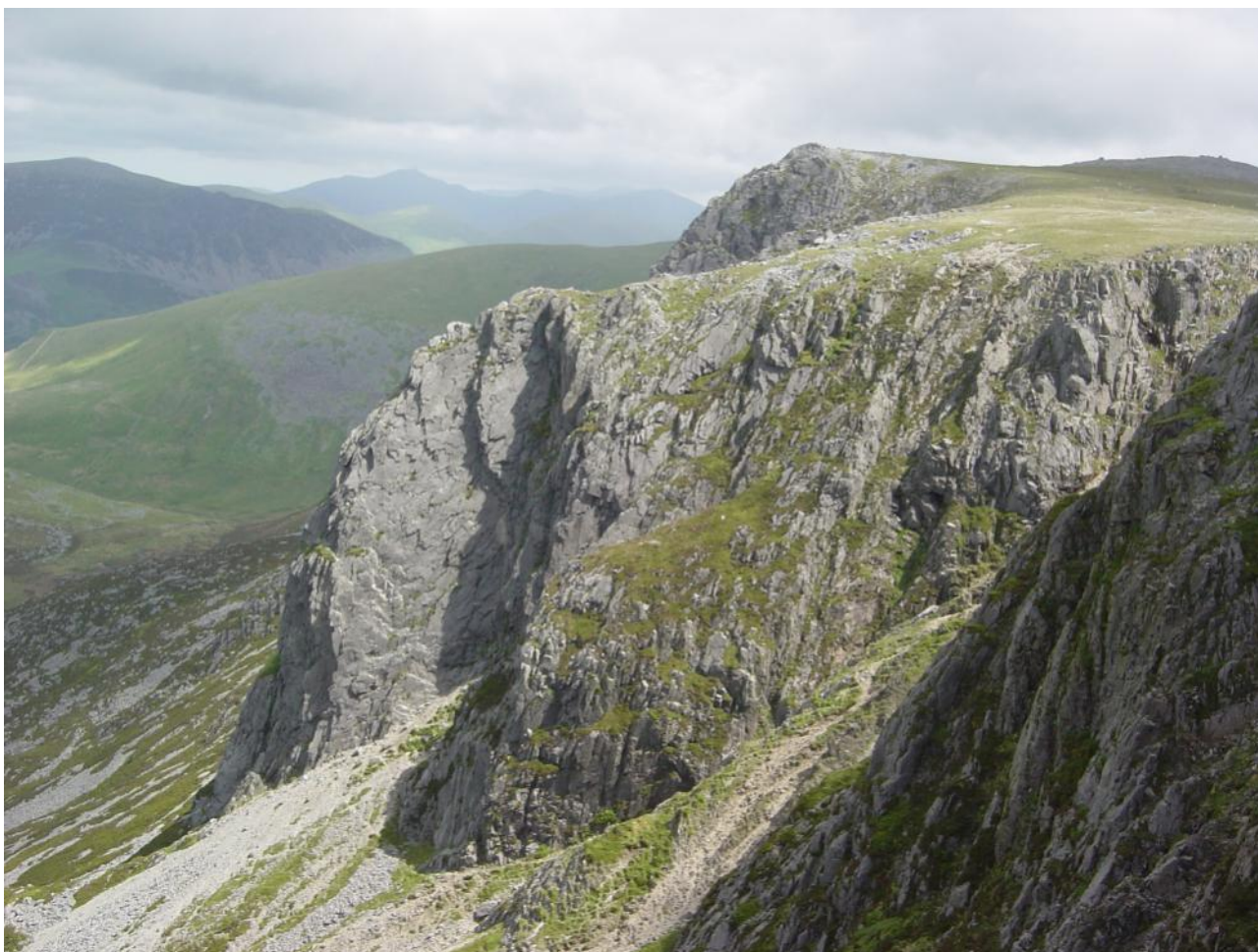
Snowdonia National Park, Wales

This will help in understanding how the UK is meeting international commitments, for example in achieving the Aichi Target 11 agreed at the Nagoya session of the CBD (which set a global target to establish protected areas covering at least 17 per cent of terrestrial and inland water areas and 10 per cent of marine and coastal areas by 2020) (Convention on Biological Diversity, 2011), and obligations set by the European Union (EU). The revised material will help the UK Government and devolved administrations in Northern Ireland, Scotland and Wales, to understand how they are meeting their country-level nature conservation priorities; for example, in relation to Nature Improvement Areas and the new Biodiversity Strategy in England (Defra, 2010); and help to build on the UK National Ecosystem Assessment (UK National Ecosystem Assessment, 2011). The information will also help to raise the public profile of protected areas which meet international standards, especially by giving free public access to maps and interactive computerised records (through www.protectedplanet.net the website of the WDPA). Better information for land use strategies will be available through the database; local people should be able to make better informed decisions about the designation and management of protected areas; and