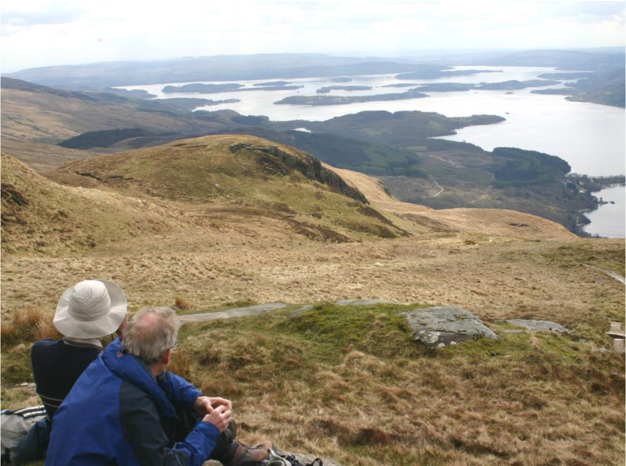
Loch Lomond & The Trossachs National Park from Ben Lomond owned in part by NGO The National Trust for Scotland