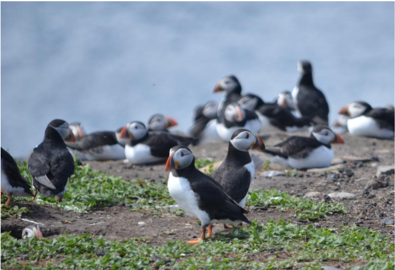
Puffins ( Fratercula arctica ) on the Farne Island, England

The names that IUCN attaches to the categories are not used in the Handbook, because of the confusion that can occur between these names and the national names for protected areas. In the UK, for example, all national parks are presently classified not as category II (which IUCN terms ‘national parks’) but as category V, and it seems likely that most, if not all, will remain in that category after assessment under the 2008 Guidelines. Also, not all the designations are clear cut and the example of category V is given below to highlight some of the issues to be resolved during the assignment process.