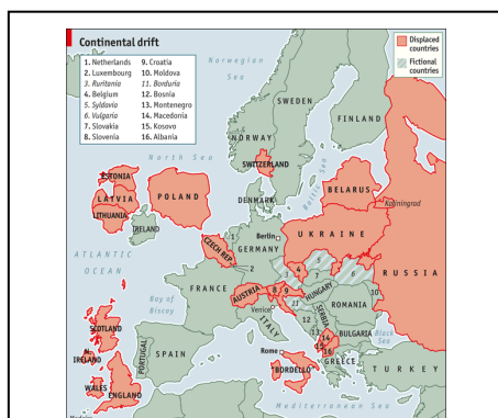
Fig. 1a. Continental drift The Economist 24May2010