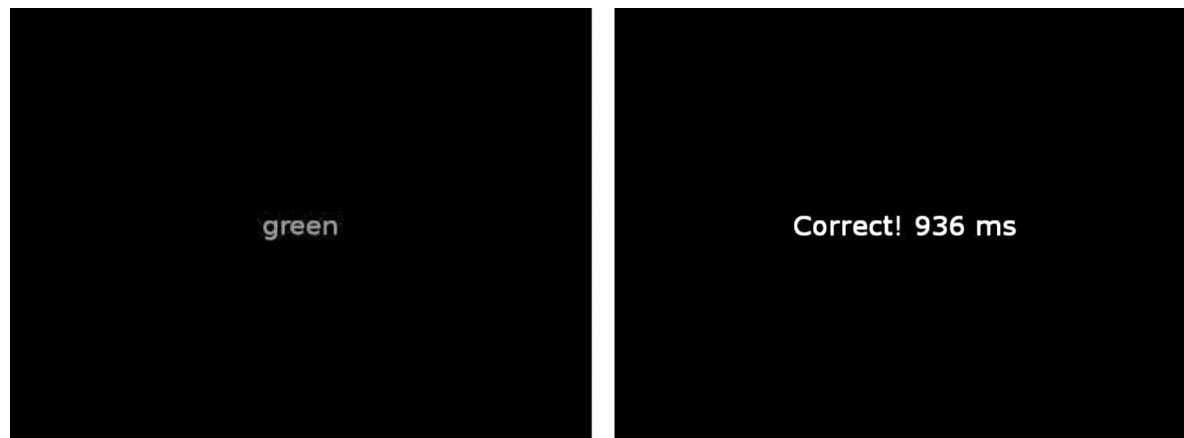
Figure 1. Stimulus and feedback screens from Sample Experiment 1.

Environment. Currently, only square environments are supported by PyEPL. To make these environments moderately plausible, we circumscribe these virtual worlds with a visible and impassable barrier—that is, a square wall. Together with the sky (rendered as a large box overhead) and the ground (or floor), these boundaries are the first main category that needs to be configured in our environment.