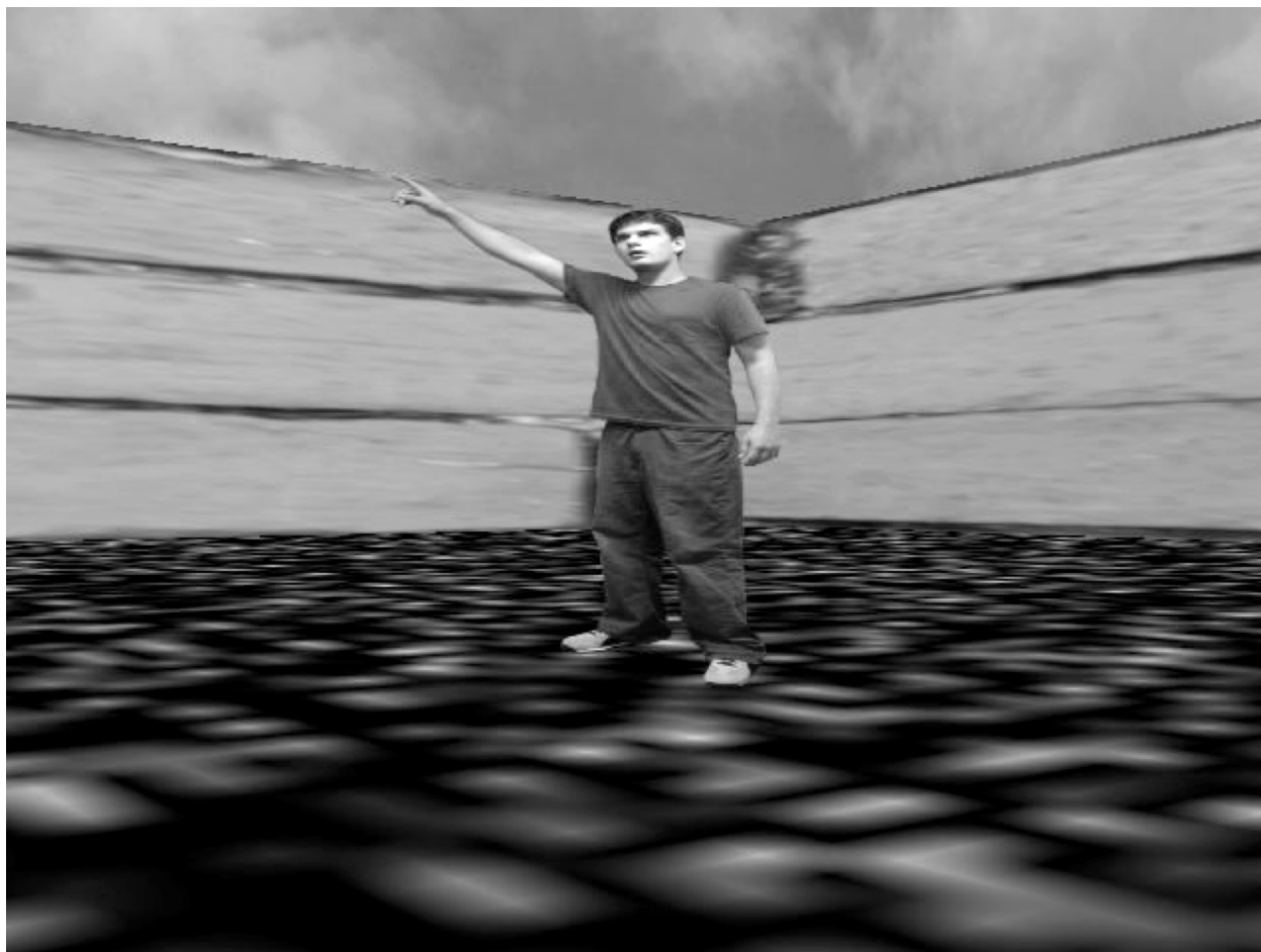
Figure 2. Screen shot of Sample Experiment 2, showing sprite (person with hand extended).

Logs. Just as in Sample Experiment 1, the Track instances used in Experiment 2 provide automated and comprehensive logging. The JoyTrack creates a log called joystick.joylog , which records the (x, y) displacement of every joystick manipulation. More importantly, the VRTrack creates a log called vr.vrlog , which records the virtual 3-D coordinates of the avatar at each iteration of the renderLoop , as well as its virtual yaw, pitch, and roll.