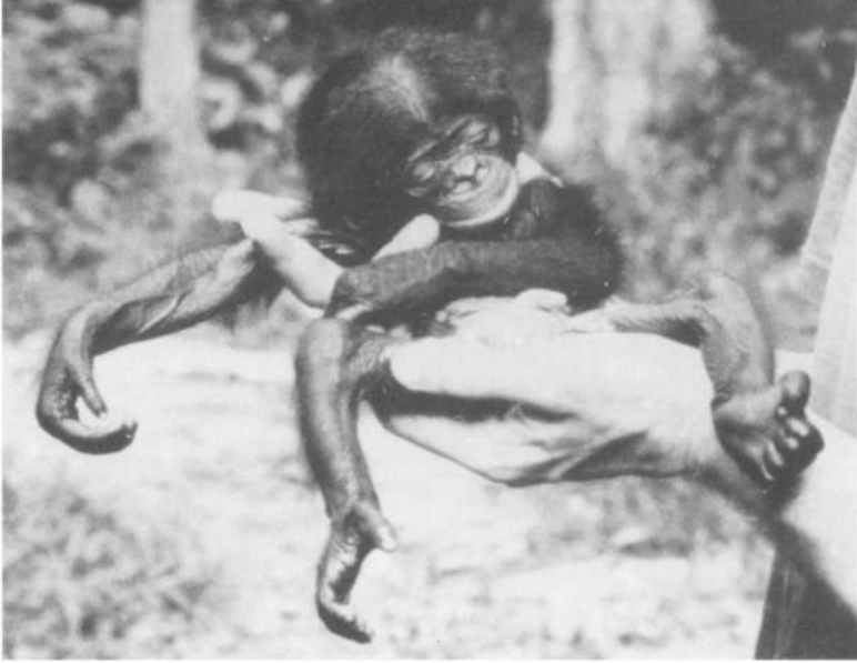
One of the captured baby pygmy chimps.